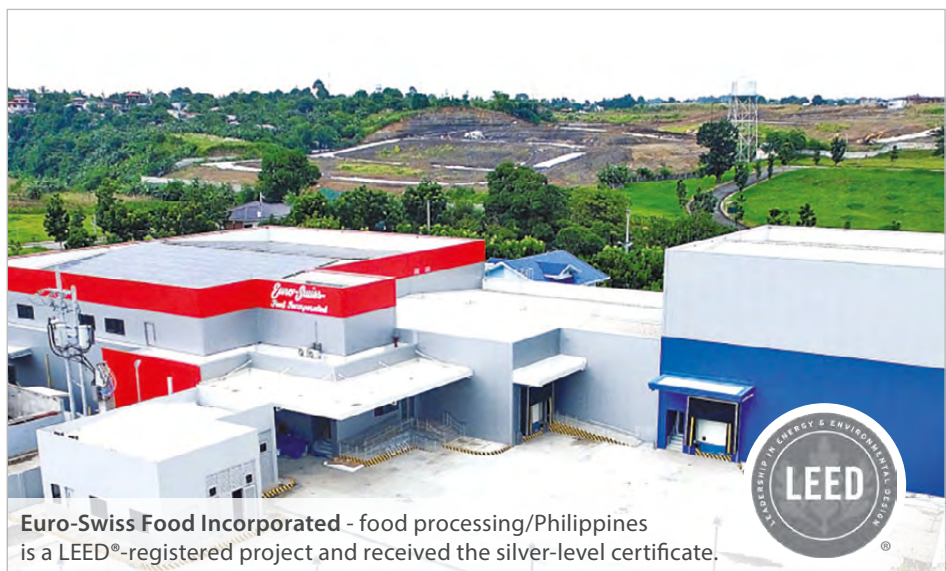
Euro-Swiss Food Incorporated - food processing/Philippines is a LEED®-registered project and received the silver-level certificate.

Following successful completion of the work, the plant received the official award from the LEED certification body. The assessment was based on the energy outlay, materials and resources, as well as the interior quality, innovation and design process.