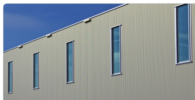
Central warehouse - Corrugate facade in pearl gold, iridescent