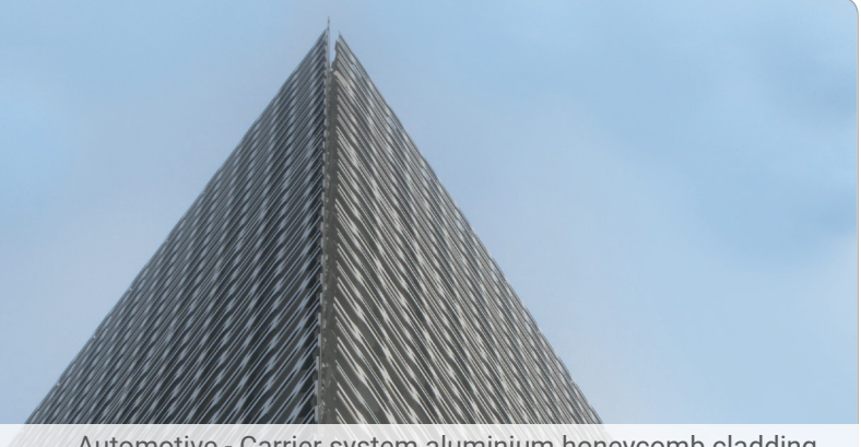
Automotive - Carrier system aluminium honeycomb cladding