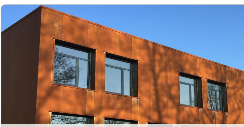
Commercial building - Facade panels with corten steel surface