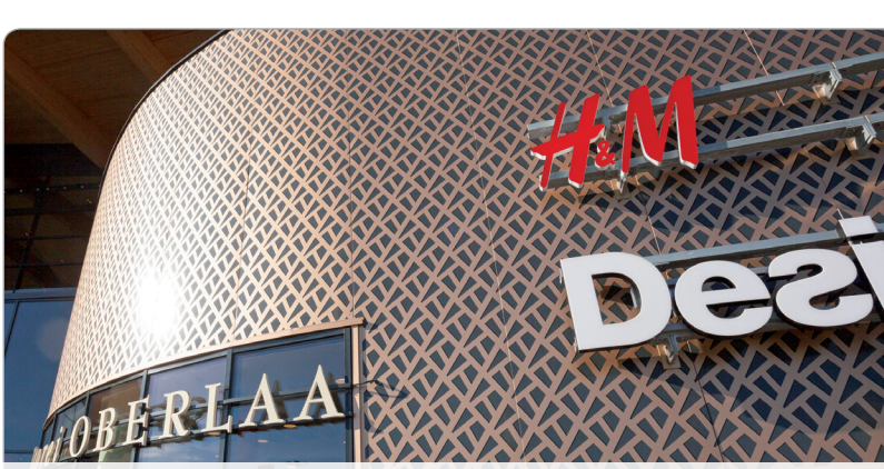
Retail - Screen printed facade in pearl gold